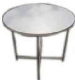
ME-T 03 Round Table Four Leg 850R x 760mm H