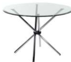
ME-T 01 Glass Round Table 800R x 760mm H