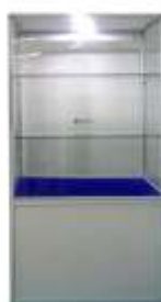
ME-SYS 07 Tall Showcase 1030 x 535 x 2000mm H