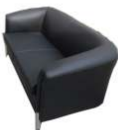
ME-S 02 Black Leather Double Seater Sofa 1400 x 680 x 740mmH