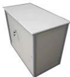
ME-SYS 02 Lockable Counter 1030 x 535 x 760mm H