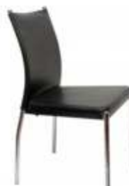
ME-C 03 Chrome Black Leather Chair 420 x 400 x 840mmH