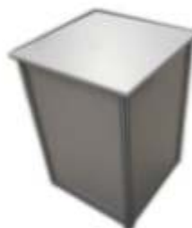
ME-SYS 04 Podium 535 x 535 x 760mm H