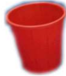
ME-A 02 Dustbin 260 x 280mm H