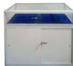
ME-SYS 05 Small Showcase 1030 x 535 x 1030mm H