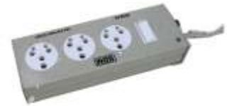
ME-E 04 15 AMP-Power Strip