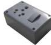
ME-E 03 15 AMP - Power Point