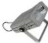
ME-E 02 150 W Metal Light