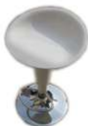
ME-BS 01 White Barstool 370 x 750mm H