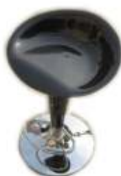
ME-BS 02 Black Barstool 370 x 750mm H