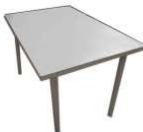
ME-T 04 Meeting Table 1200 x 800 x 760mm H