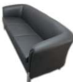
ME-S 03 Black Leather Three Seater Sofa 2080 x 680 x 740mmH