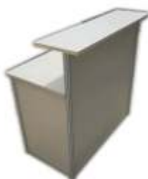
ME-SYS 03 Two Tier Counter 1030 x 535 x 1030mm H