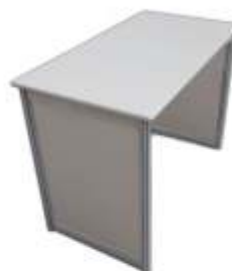
ME-SYS 01 Information Counter 1030 x 535 x 760mm H