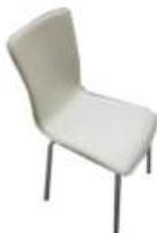
ME-C 02 White Leather Chair 420 x 400 x 840mmH