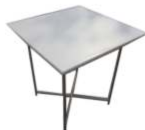
ME-T 05 Square Table 740 x 740 x 760mm H