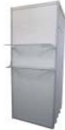
ME-SYS 10 Glass Shelf 300 x 1000 mm H