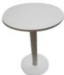
ME-T 02 Round Cocktail Table 600R x 1100mm H