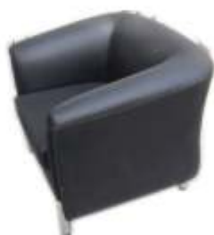
ME-S 01 Black Leather Single Seater Sofa 680 x 680 x 740mmH