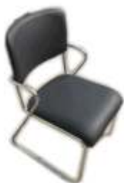
ME-C 01 Arm Black Leather Chair 460 x 430 x 820mmH